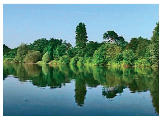
LEFT: The action takes place at a scenic, but unnamed, gravel pit.